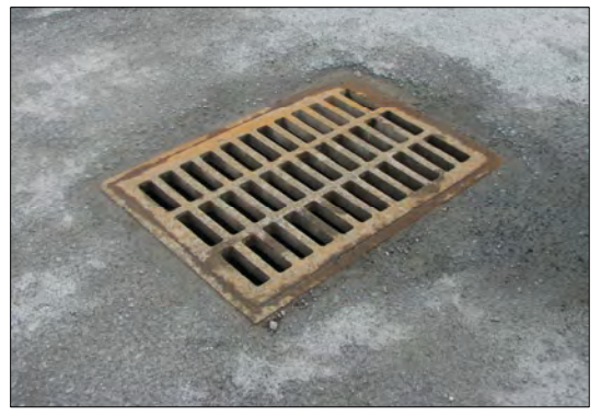
Figure 5. A storm drain on Short Street that transports sediment directly into Vanderbilt Creek.

Garbage and other debris can reduce aesthetics, introduce contaminants, impede fish passage and degrade habitat. Sources of debris in Vanderbilt Creek include littering, sediment/debris wedges from naturally occurring landslides, and potentially windblown, loose debris from the nearby landfill or other areas.