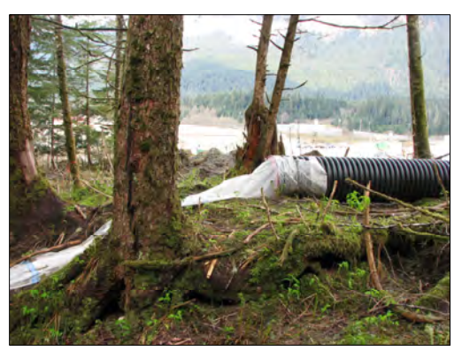
Figure 9. The temporary water diversion conduit that transports stormwater from the hill behind Home Depot into Vanderbilt Creek. June 2007

There are several conveyances of concern: a drainage pipe conveying stormwater from the located along Glacier Highway accumulating sludge, a grate located on Short Street, and the conveyance diverting runoff from the HD site. Improvements on some of these conveyances are listed as separate actions.