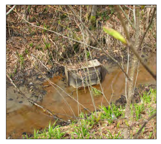
Figure 6. A TV in a ditch that drains from Charles Way to Vanderbilt Creek.