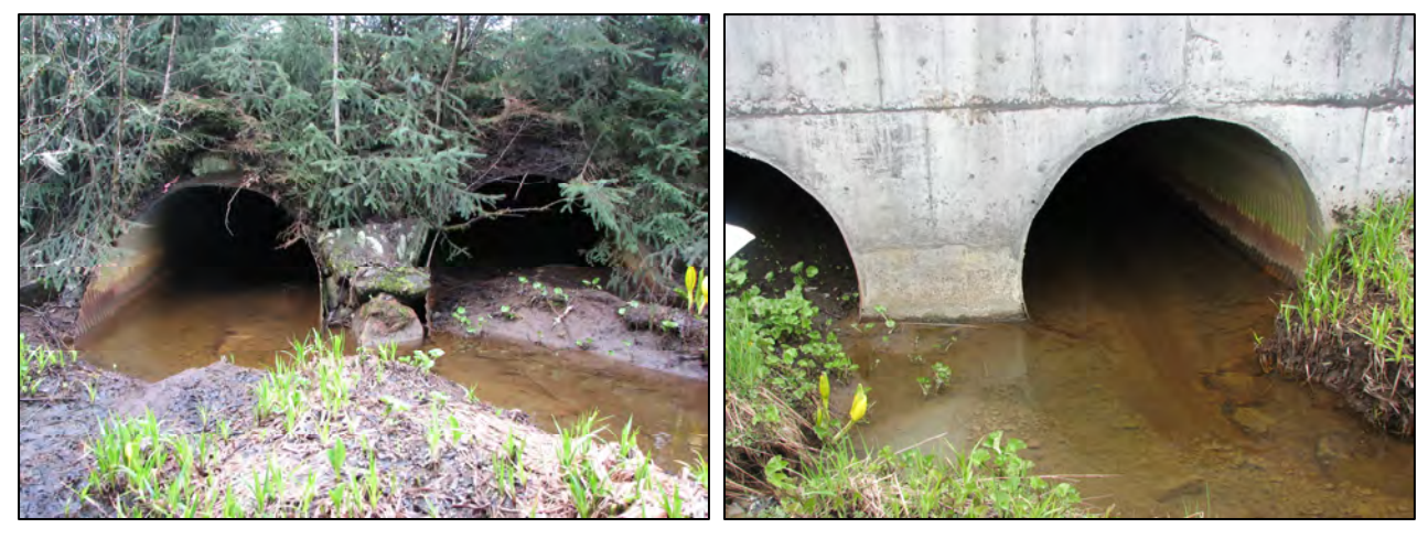
Figure 10. The inlet (left) and outlet (right) of the Glacier Highway culverts. As shown, one of the culverts has failed due to sediment build up.

Action 2.3.1: Replace culverts located on Glacier Highway, near the north entrance of Western Auto/Grant Plaza