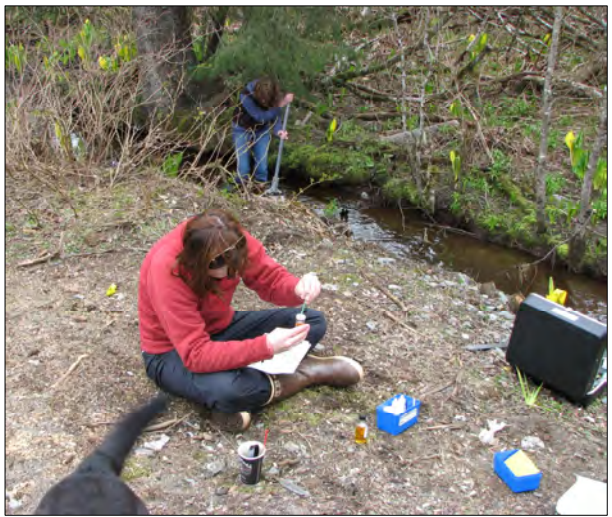
Figure 8. JWP volunteers conducting a rapid bioassessment on Vanderbilt Creek.

A rapid bio-assessment of Vanderbilt Creek was completed by the University of Alaska Anchorage Environment and Natural Resources Institute (ENRI) in May of 2003 (Rinella et al. 2005). A rapid bio-assessment provides a "snapshot" of conditions in the creek using macroinvertebrates bio-indicators. as The parameters measured during this study included dissolved conductivity. pH, oxygen, temperature, and discharge; a visual assessment of riparian and streambed habitat; and an assessment of the macroinvertebrate assemblage. Data was collected along a 100meter stretch of creek where Discovery Alaska's office used to be located. Data from ENRI (see Appendix C) continues to suggest that Vanderbilt Creek is an impaired waterbody.