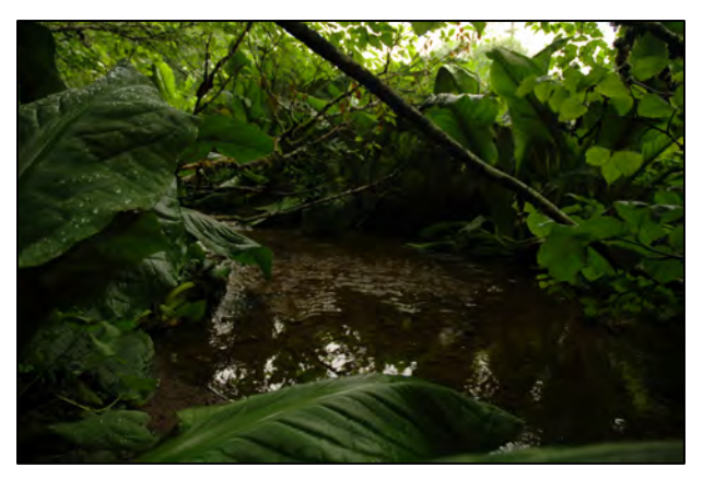
Figure 1. Vanderbilt Creek at the entrance to the Lemon Creek Trail off of Glacier Highway.

Vanderbilt Creek is a small creek located on the eastern side of Lemon Creek Valley, about 5 miles northwest of downtown Juneau, Alaska. The watershed consists of approximately 93 hectacres of land (Rinella et al. 2005) and is bound by Blackerby Ridge to the east; residential and commercial areas to the north; with commercial areas continuing to the west; Channel Landfill to the southwest; and the intersection of Vanderbilt Hill Road and Egan Drive to the south (Figure 3). Vanderbilt Creek is approximately one mile (2 km) long, with major tributaries flowing from Blackerby Ridge.