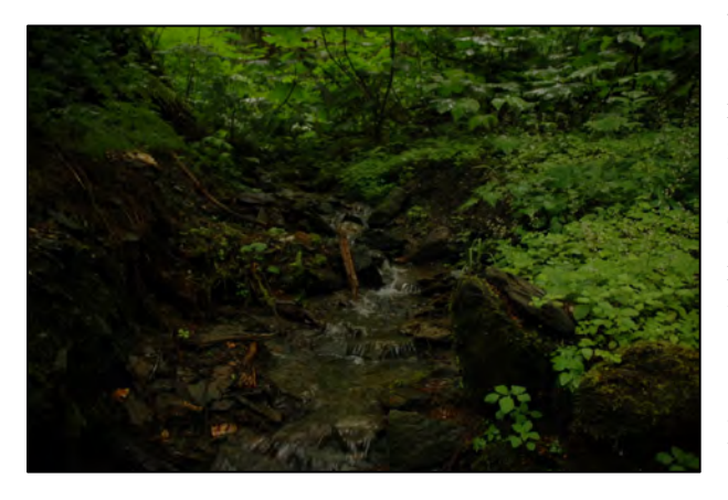
Figure 2. A tributary flowing from Blackerby Ridge, located along the Lemon Creek Trail.

The headwaters of Vanderbilt Creek flow through steep, forested uplands before entering a nearly level course passing through urban areas, wetlands and braided channels. Vanderbilt Creek enters Gastineau Channel at the intersection of Egan Drive and Vanderbilt Hill Road.