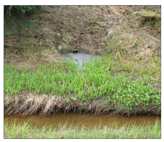
Figure 7. A small drain with a pool of sludge accumulating near Vanderbilt Creek.

Other pollutants of concern not listed in the TMDL include hydrocarbons and landfill leachate. Hydrocarbons are introduced to the creek from oil, gasoline, and other chemicals used for vehicle maintenance and operation. Due to heavy road traffic and large parking areas in the vicinity of Vanderbilt Creek, hydrocarbons are likely pollutants. Leaks, spills, or improper disposal of chemicals containing hydrocarbons could lead to their being washed into the creek with stormwater runoff, but there is no current data for hydrocarbons in Vanderbilt Creek to quantify this.