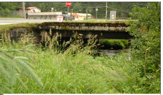
Figure 12. One of the creosote bridges crossing Vanderbilt Creek.

Action 3.1.4: Differentiate between the <sup>1</sup> upper and lower reaches of the steam above and below Glacier Highway and remove the silt that has accumulated in the stream.