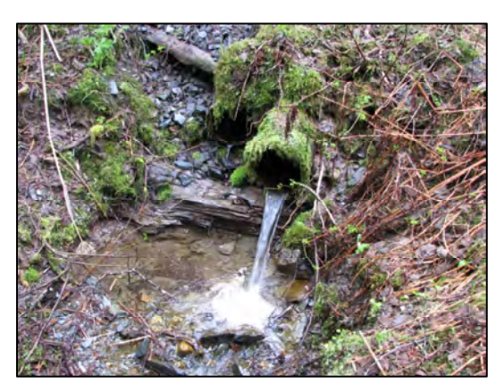
Figure 11. One of several undersized, perched culverts on Vanderbilt Creek along the Lemon Creek Trail

Though fish have not been seen using many of these tributaries (Pat Quigley, personal communication, May 13, 2007), Frenette suspects that coho have historically used the waters and will do so again once the habitat is reconnected. Replacing these culverts with bridges would allow each tributary to flow naturally across the landscape, reconnecting the habitat. Frenette says proper stream crossings would also prevent road washout along the Lemon Creek Trail. Again, these culverts can be assessed using the US Forest Service' (USFS) "FishXing" software and alternatives for replacement structures can be considered.