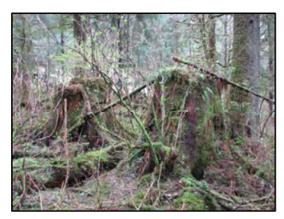
Figure 4. Decaying tree stumps from logging along Lemon Creek Trail.

Section 305 (b) of the Clean Water Act requires states to evaluate all surface waterbodies and establish maximum allowable levels